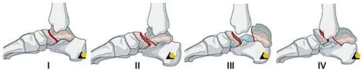
Fig. 2. Hawkins talar neck classification; types I-IV.