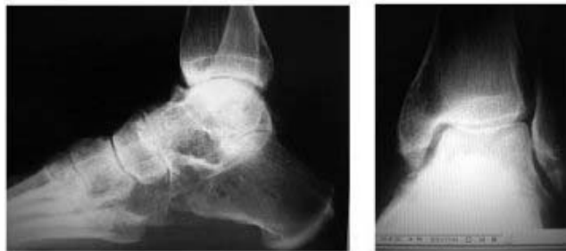
Fig. 6. Extruded talus debridement before and after reimplantation.