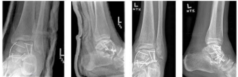
Fig. 4. Comminuted talus fracture, 6 and 26 weeks postoperative.