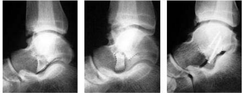
Fig. 5. "V-Sign" indicating a displaced lateral process of the talus fracture.

The lateral process of the talus is a unique structure with dorsolateral and inferomedial articular facets that articulate with the fibula and calcaneus, respectively. The lateral prominence is the site of insertion of the talocalcaneal ligament, and as such, it may be injured in an avulsive tensile fashion, or from large direct mechanical loads from the fibula or calcaneus. These injuries have