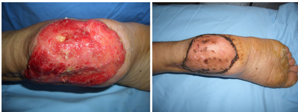
Fig. 4 After NPWT removal, the wound showed viable granulation tissue, and a partial-thickness skin graft was employed for wound treatment; complete healing occurred 8 days after NPWT removal

Lee et al. [10] demonstrated in an animal model the active role of leeches in minimizing flap necrosis after venous congestion. In this case the data concerning the success rate of leech therapy are not clear. NPWT has