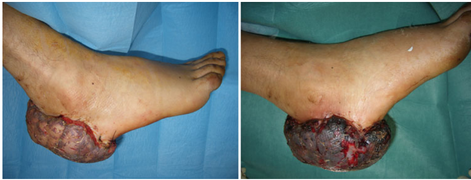
Fig. 2 Two days after flap harvesting, venous congestion and flap edema were observed, causing marked flap hypoxic ischemia and partial flap necrosis