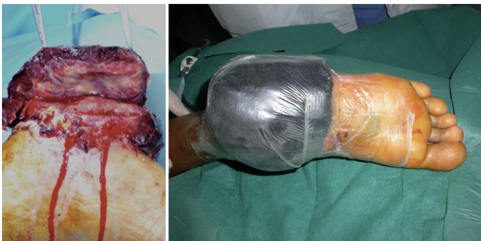
Fig. 3 Twenty-five days postoperatively partial debridement of the flap was performed, and NPWT was applied for 2 weeks